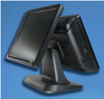
Optional Integrated 15" Rear LCD Customer Display