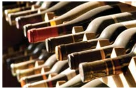
Pizza / Table Service / Quick Service / Liquor Stores