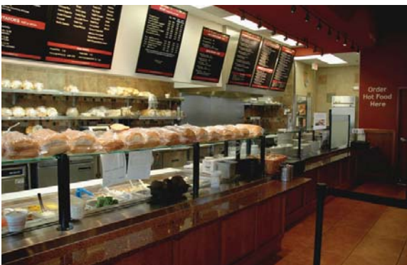
Cafeterias / Delis