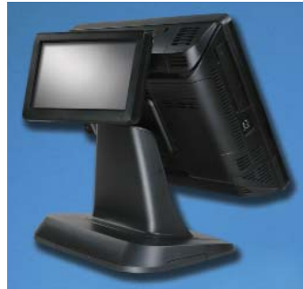
Optional Integrated 7" Rear LCD Customer Display