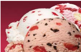
Bars / Ice Cream / Small Grocery