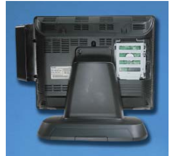
Tool-Free Access to Hard Disk Drive and RAM Optimizes Serviceability