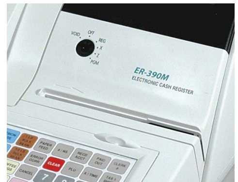
Internal Magnetic Card Reader Option