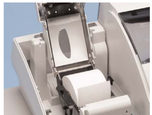
Quick and Easy Drop-In Paper Loading