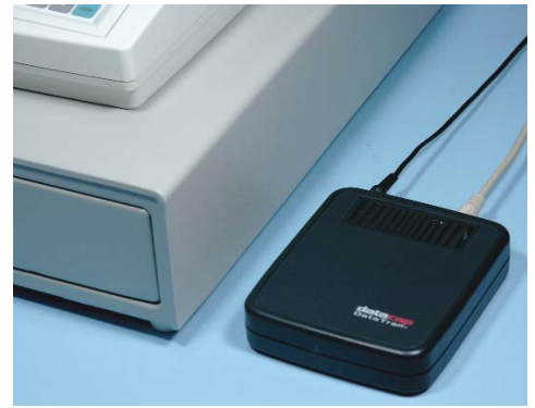
DataTran™ Integrated Electronic Payment Option